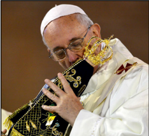
Pope Francis I Kissing the Black Madonna at Brazil's National Shrine, 24 th July 2013

"Thou shalt not bow down thyself unto them, nor serve them" (Deuteronomy 5.9a)