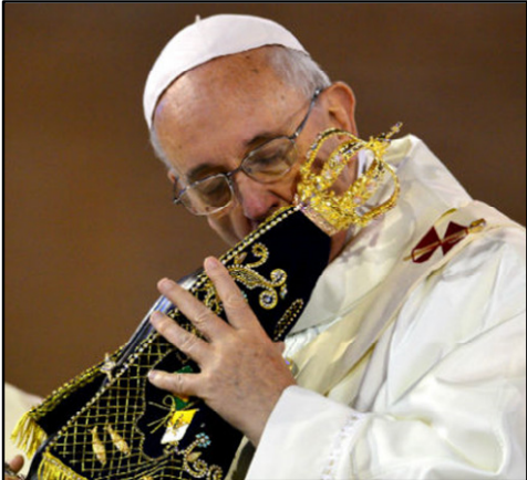
Pope Francis I Kissing the Black Madonna at Brazil's National Shrine, 24 th July 2013

"Thou shalt not bow down thyself unto them, nor serve them" (Deuteronomy 5.9a)