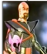
Xenu (1987) by the BBC.